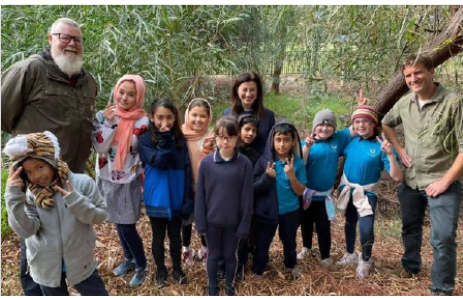
Blair Athol North B-7 Primary School Grassroots Application