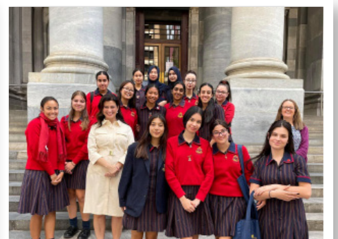
Our Lady of the Sacred Heart Parliament House Tour