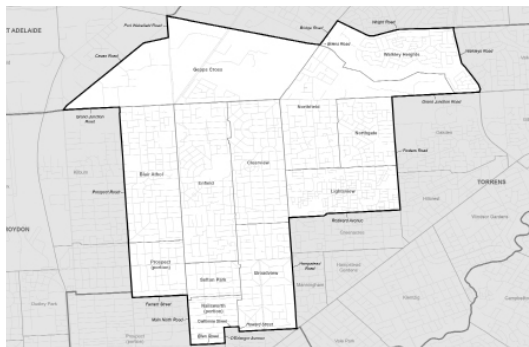
Enfield Electorate Boundary after 2022 State Election