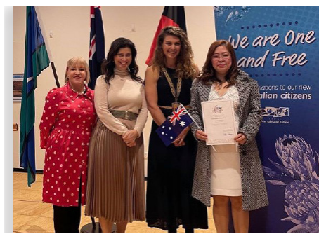
Port Adelaide Enfield Citizenship Ceremony