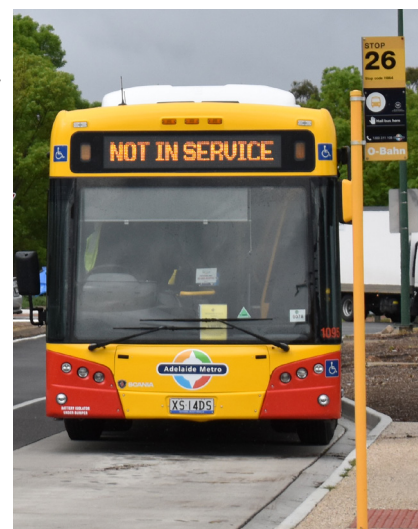
Not in Service Bus at a Lightsview Stop