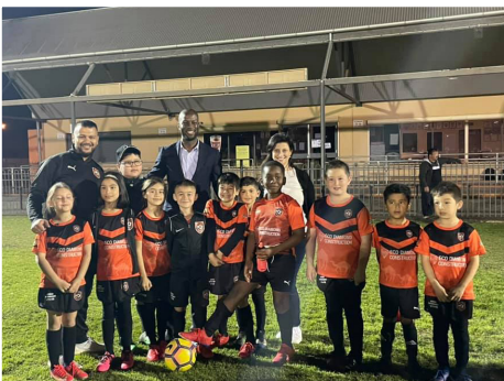
Ghan Kilburn City FC Visit with Special Guest, Bruce Djite