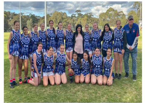
Gepps Cross Womens Football Club Reconciliation Round