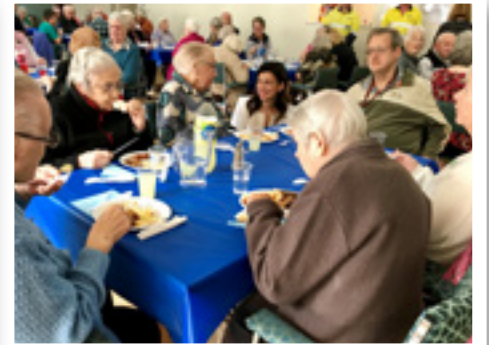
Bartonvale Retirement Village Neighbour Day Lunch