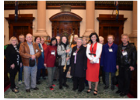
Ukrainian Society Parliament House Tour