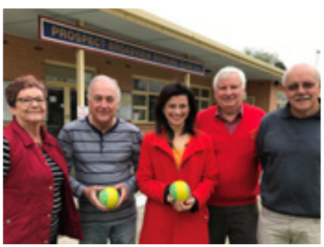
Prospect Broadview Bowling Club Committee