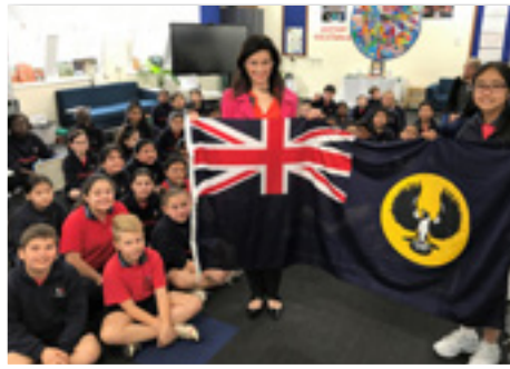
St Gabriel's School Enfield