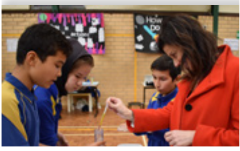
Northfield Primary School Science Expo