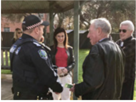
Peter McKay Reserve Kilburn Community Safety Street Corner Meeting