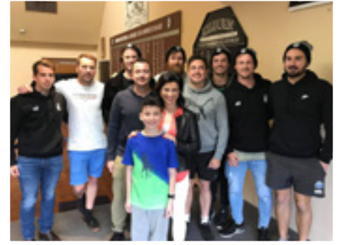
Kilburn Football and Cricket Club Fundraising Day