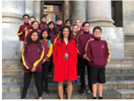
Enfield Primary School Parliament House Tour