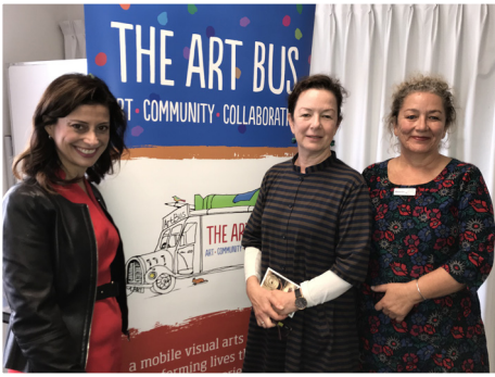
Kilburn - Portrait of a Place Opening Kilburn Community Centre