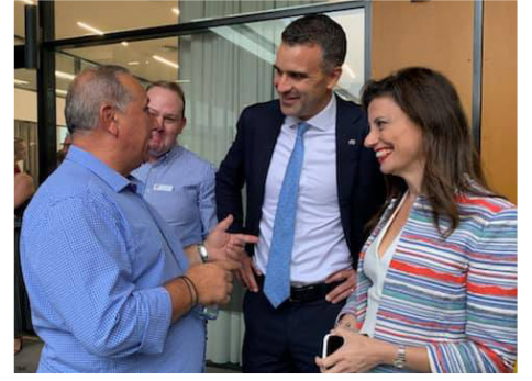
Port Adelaide Enfield Citizenship Ceremony