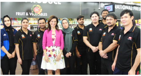
Blair Athol IGA and Khurasan Supermarket