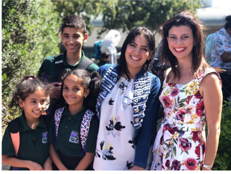
Prospect North Primary School