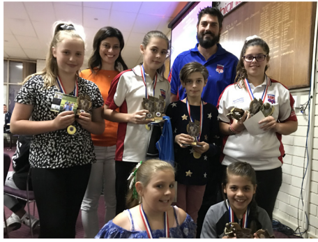
Gepps Cross Cricket Club Girls Strikers League Team