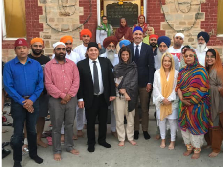
Gurdwara Sarbat Khalsa, Prospect, Adelaide